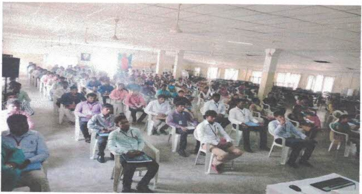
EXIMO SERVICES DRIVE