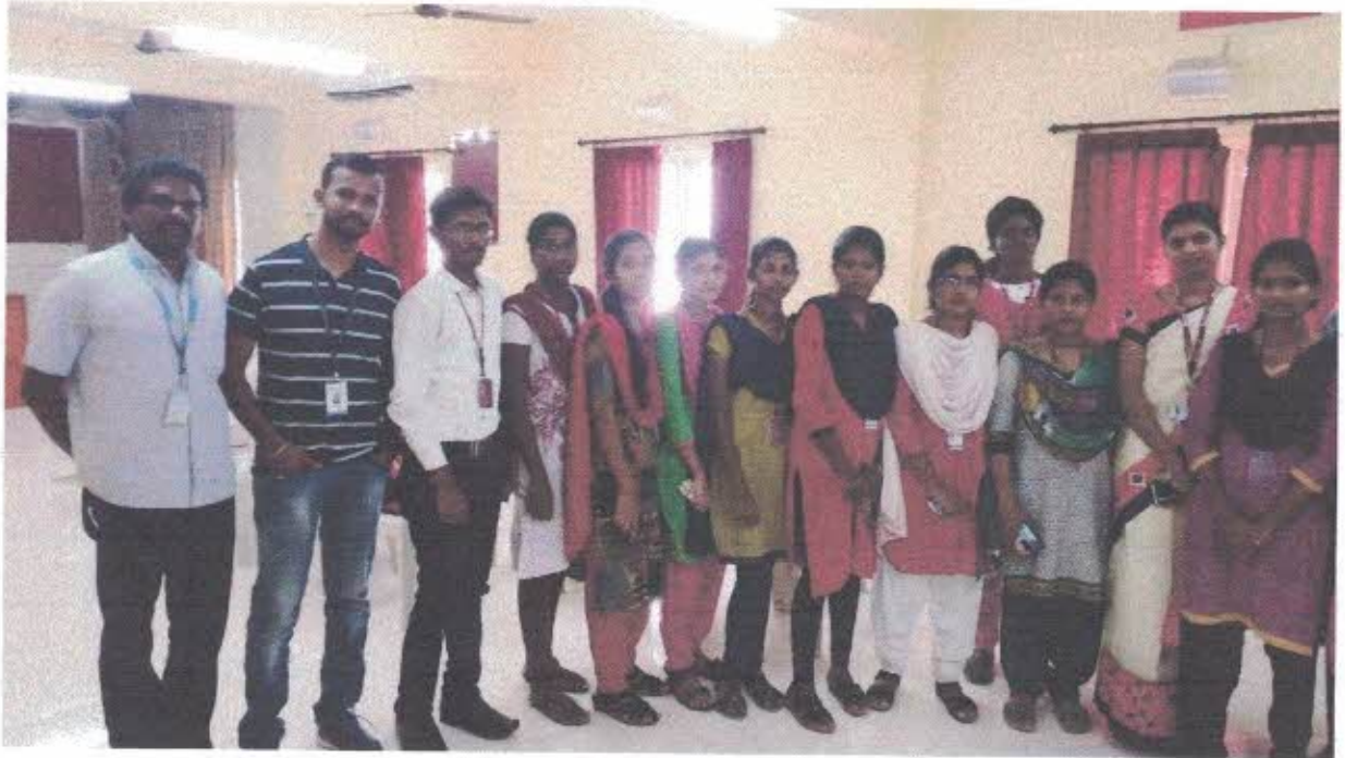
VISIONARY RCM DRIVE

Accredited by NAAC with 'A' Grade & Recognized u/s 2(f) and 12(B) of the UGC Act 1956 Kalippatti - 637 501, Namakkal (Dt), Tamil Nadu.